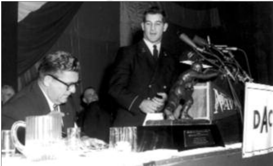
1960. Joe Bellino wins the Heisman Trophy after sweeping the field with 436 first-place votes.

BELLINO: That was the summer of '65, and I accepted a contract at Patriot camp, resigned my active commission from the Navy, but stayed in the Reserves.